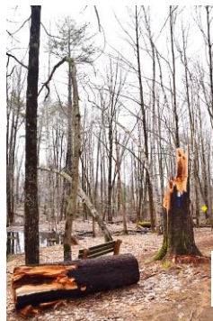
Along the Blue Trail

We can take comfort in the fact that downed trees create new habitats for a healthy forest serving as a rich and fertile seed bed for young trees, other plants, for mosses, lichens and fungi as well as many different types of invertebrates.